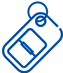
Covered Vehicle Key/Fob